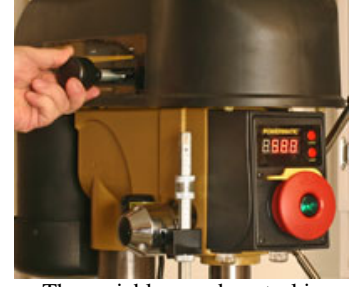
The variable speed control is operated by moving the lever (when the PM2800 is running) on the side of the head. This placement makes it easy to adjust speed and watch the LED readout at the same time.

To make selecting specific spindle speeds easy and accurate, a large LED display is mounted on the front of the POWERMATIC 18" Drill Press. Also on that panel are the laser and work light buttons as well as the large pull On, push Off switch (with safety key) that operates the POWERMATIC 18" Drill Press.